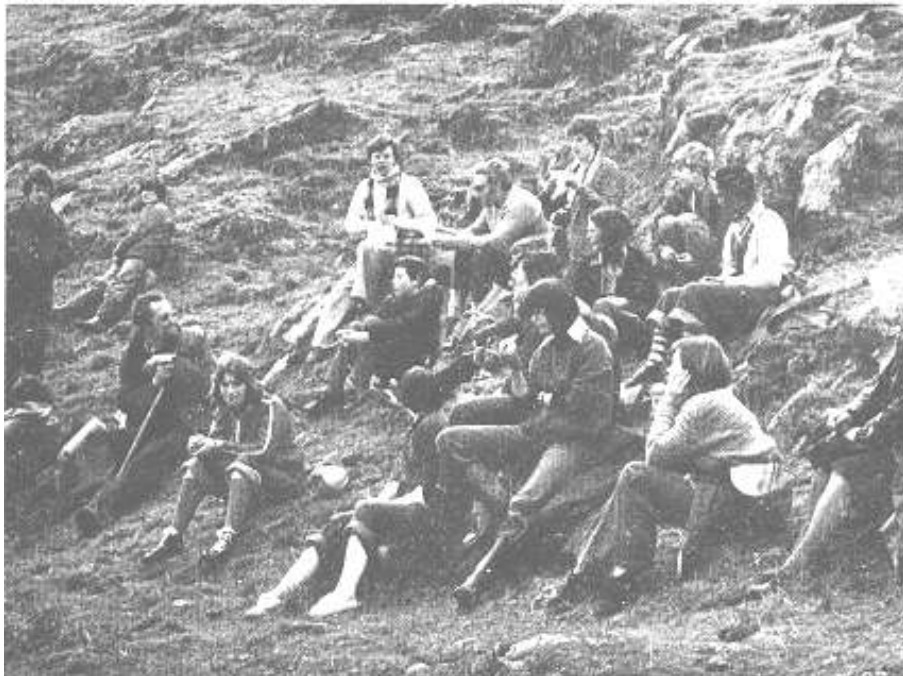
YOUNG PEOPLE ON THE MARY JONES SPONSORED WALK, 1977

Some of the young people meet every Sunday night for discussion and Bible study. From time to time they also meet at the Manse with some of the young people from Brent Knoll. Two years ago they organised a most successful sponsored walk for the Bible Society, raising £200.