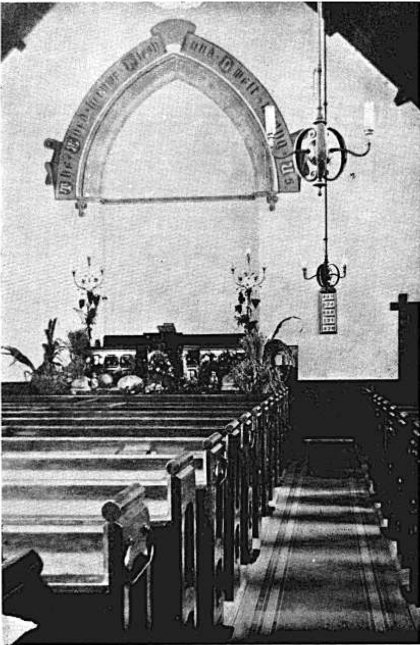
INTERIOR OF THE CHURCH IN 1911