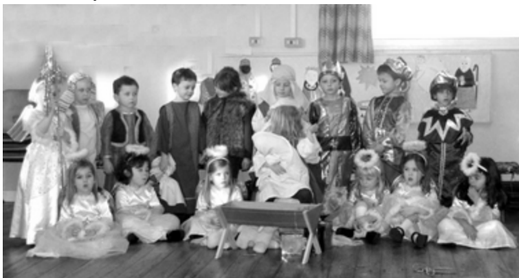
East Brent First School Nativity Play