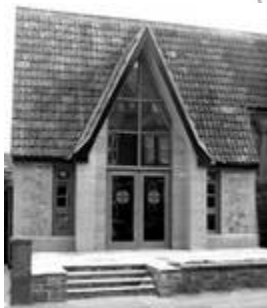
BURNHAM ON SEA