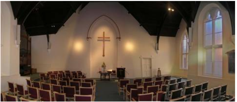
The interior of Burnham Methodist Church