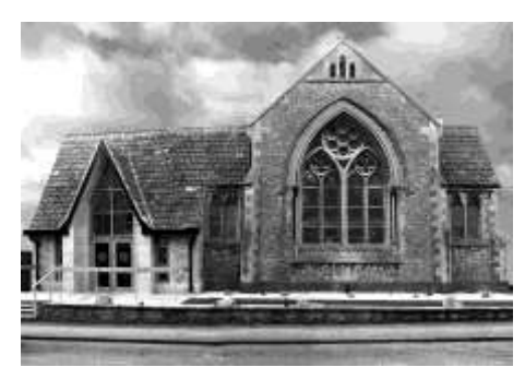
BURNHAM ON SEA