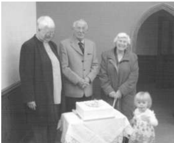
In the picture