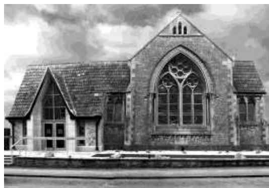
BURNHAM on SEA