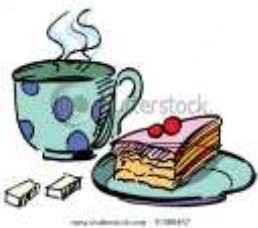
Table Top Sales and lots of free coffee, cakes and chatter

Donations for The Children’s Safe House in North India