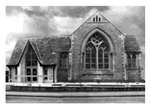
BURNHAM ON SEA