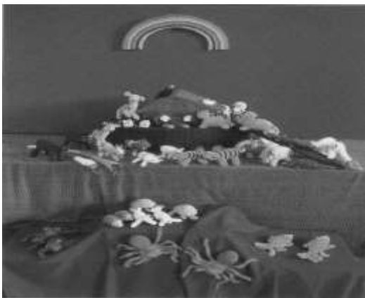
THE KNITTED BIBLE IS COMING TO ROWBARTON METHODIST CHURCH, GREENWAY ROAD, TAUNTON. TA2 6LA

wherever they live. When someone no longer has to walk miles every day to collect water from a muddy pond and can get clean water locally, either from by turning on a tap, or pumping it up from a local well, everything changes for them. The health of everyone in the family improves, children can attend school and less of what little income the families have is spent on medicines for water borne diseases. A big change brought about by donating our small change!