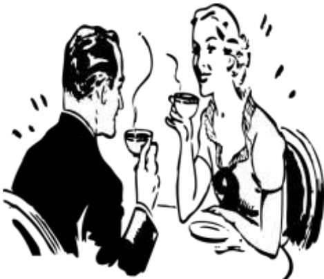
Table Top Stall