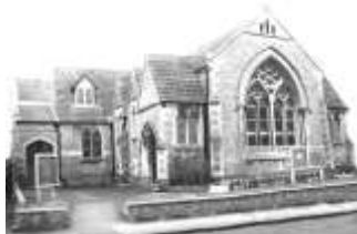
BURNHAM ON SEA