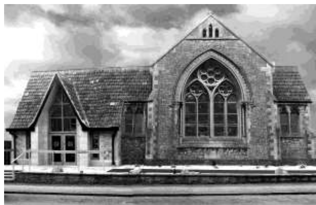
BURNHAM on SEA