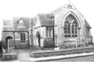
BURNHAM ON SEA