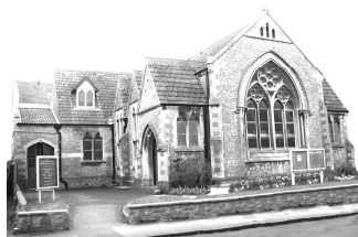
BURNHAM ON SEA